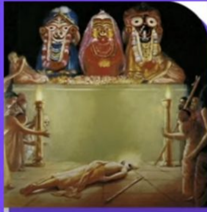
Meeting with Sārvabhauma Bhaṭṭācārya

Caitanya Mahāprabhu entered the Jagannātha temple and saw Lord Jagannātha, He immediately lost His senses and fell down on the ground