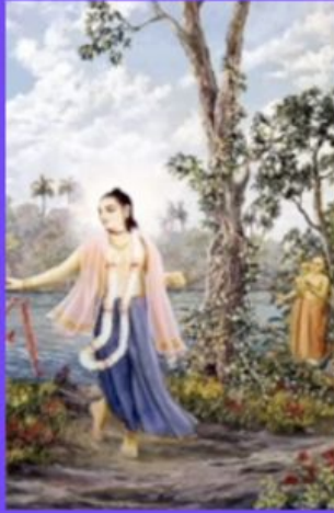
Journey to Jagannath Puri

He visited various temples and heard the story about Mādhavendra Purī and the installation of Gopāla