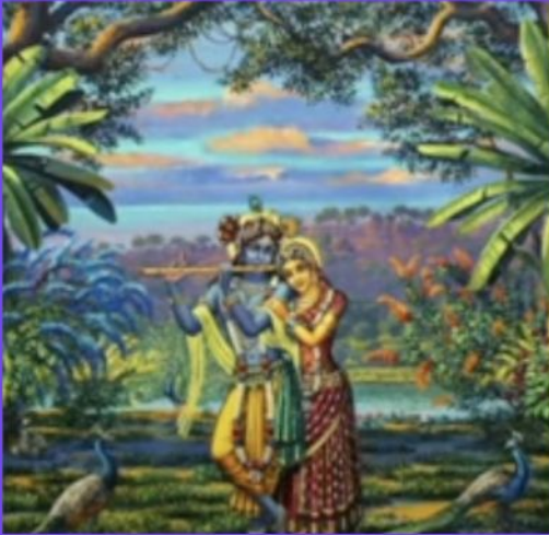
Radharani's thought at Kurukshetra

She thought of Him in the calm and quiet atmosphere of Vṛndāvana, dressed as a cowherd boy.