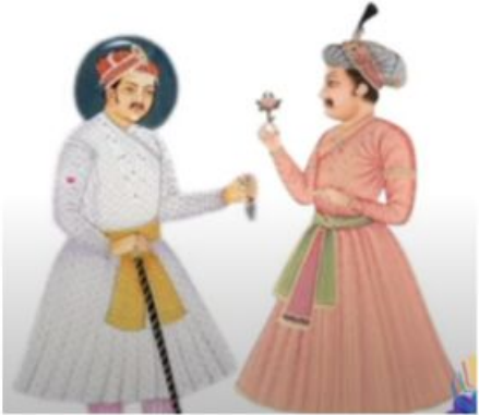
The Two Brothers